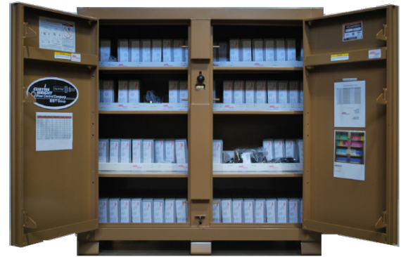
EST Group's Job Box program increases plant uptime by providing you with all the installation tools and plugs you need on site and ready to use prior to any planned outage or emergency.