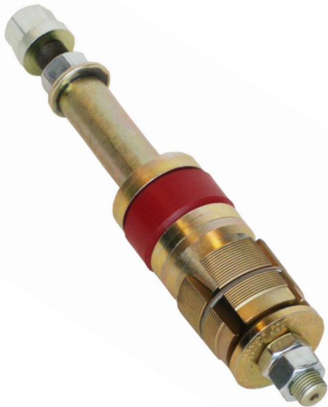
3/4" - 6" (DN20 - DN150) GTRP

Eliminate concerns over inadequate joint strength when pressure testing welded flange connections