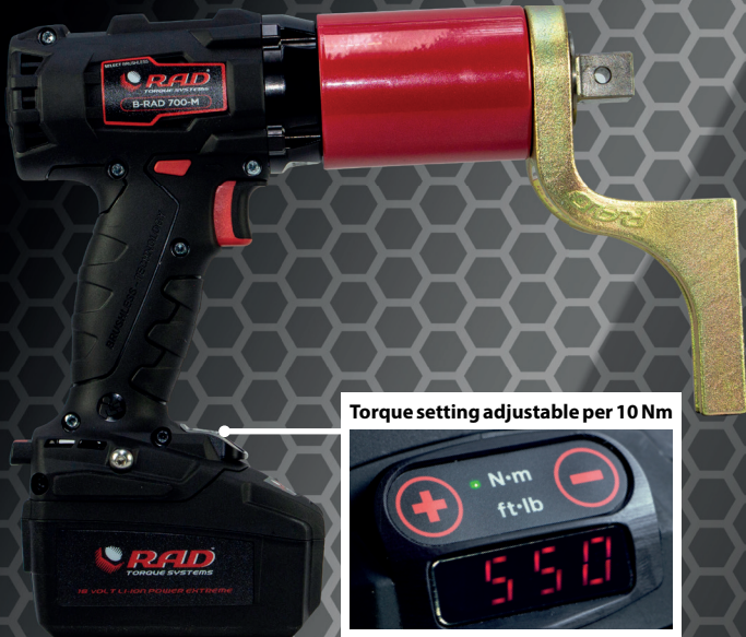
Torque setting adjustable per 10 Nm