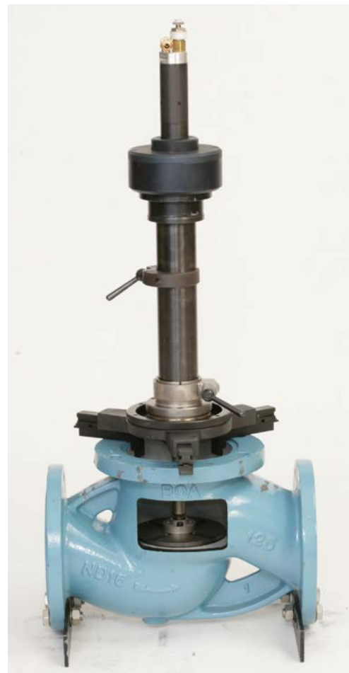
TSV-150 with jaw chuck