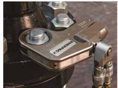
Any brand of hydraulic torque wrench can be powered by the portable ZU4T-Series torque pump. ▶