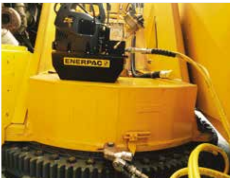
◀ Crane maintenance and assembly with S1500X wrench powered by the ZU4T-Series torque pump.